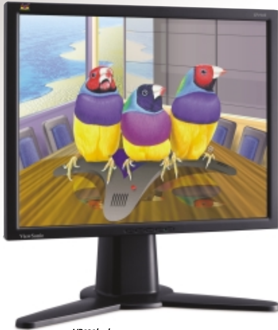
VP191b shown. Also available in silver (VP191s)