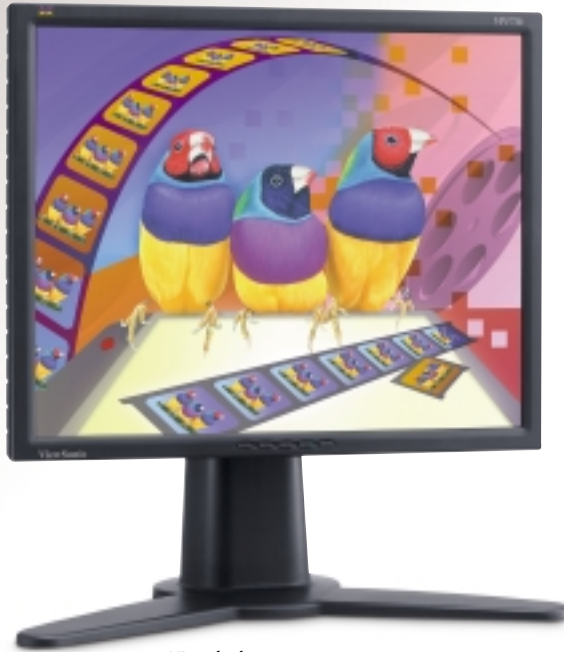
VP171b shown. Also available in silver (VP171s)

Broaden your horizons with this ultra-narrow frame.