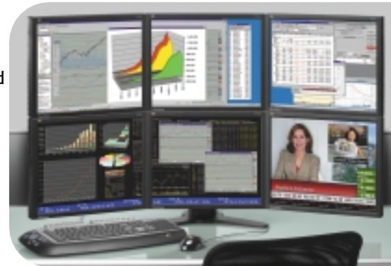
ThinEdge design is ideal for multi-panel setups. Three unit panel-module-only (without base) multi-packs available.

Whether you're a graphics professional, corporate executive or power gamer, the 17" VP171s and VP171b LCD displays will enhance your productivity and enjoyment. Their THINEDGE™ ULTRA-SLIM BEZEL DESIGN enable multiple-display configurations in immaculate digital HDTV clarity for powerful multi-tasking and mixed-media data analysis. XtremeView® wide viewing angles and ClearMotiv™ 16ms broadcast-quality video response ensure intense visual performance. Class-leading features include comprehensive HEIGHT, PIVOT, TILT AND SWIVEL adjustments and multiple digital/analog inputs. Step up to the 17" LCD display that sets the price/performance benchmark, the ViewSonic VP171s or VP171b.