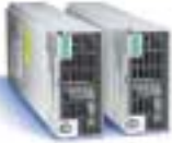
500W power supplies shown