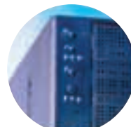
Intel® Rapid Recovery Toolkit