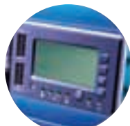
Intel® Local Control Panel