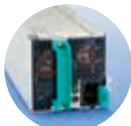
Intel® Power and Thermal Headroom