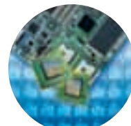
Intel® Validation Stress Test Suite

For more information on these technologies, please visit: http://developer.intel.com/design/servers/technologies/