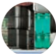
Intel® Active Airflow Control

Intel server technologies provide powerful capabilities designed to make server systems more reliable, more available, and easier to service. Seamlessly integrated into the latest generation of Intel® Server Products, these technologies work in concert to complement the capabilities of the most current Intel processor and chipset technologies.