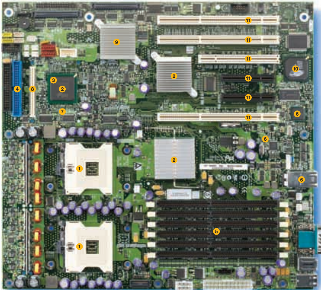
Server board shown is model (product code) SE7520BD2SCSI